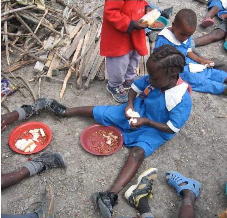
Lunch at St. Timothy Academy