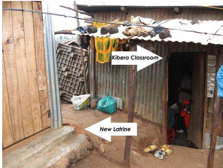
New Latrine Built in Kibera

Last December, the Ed Colina Foundation agreed to pay for sweaters and build a latrine for a small school in the Kibera slum. The sweaters were purchased and the latrine, pictured above, was completed. This month, the Foundation agreed to buy chairs for the 65 students in the school. Thank you!