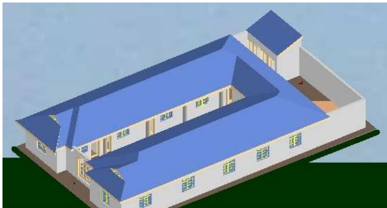
Proposed Resource Center