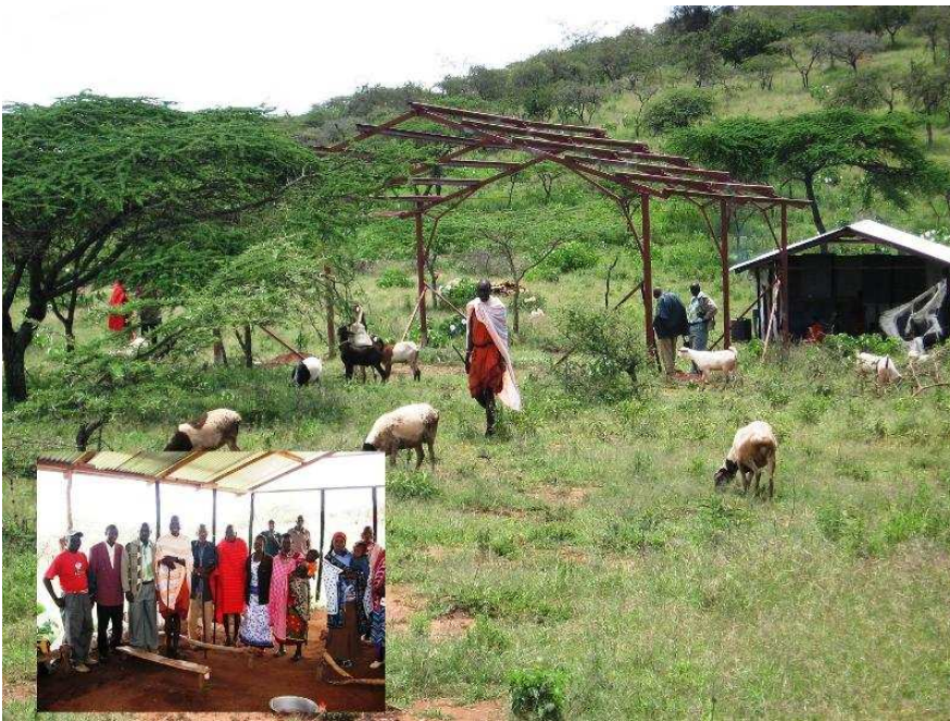
Kajiado Preschool Site (Maasai Committee)

The preschool at Kajiado is becoming more a reality. The local church was given a site on Masai land and the Foundation has the opportunity to take over the use former small church. The renovations will take some iron sheets, gutters, a water tank etc. to get the building prepared. We will share the costs of two ECDE teachers with the local Masai and begin a food program. There are about 40 students (not currently attending school) who are ready to attend. We will be making several trips to the remote site, about three and a half hours from Athi River. The last half hour is a long walk to the site of the school. We have created a budget and are working to see if we can possibly answer this request. Kajiado is the ancestral home of many of the Maasai we work with in Athi River.