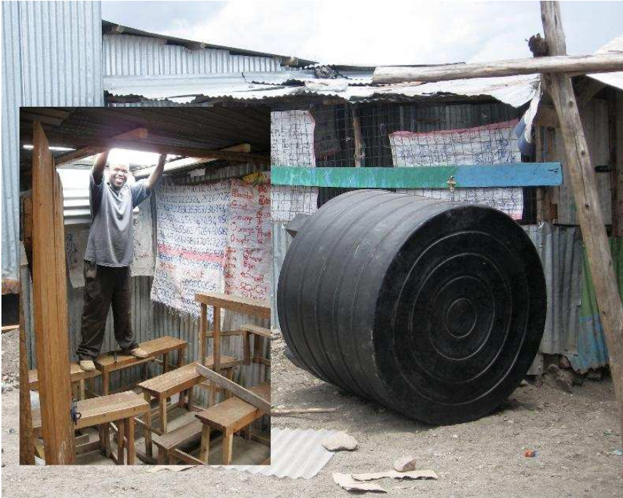
St. Tim Renovations