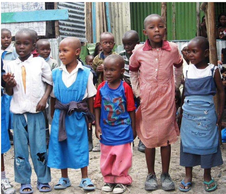
Children From St. Tim's Sing